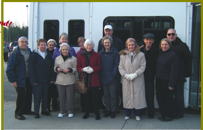
Senior Center travelers visited the Virginia Museum of Fine Arts and the Holocaust Museum on January 6.